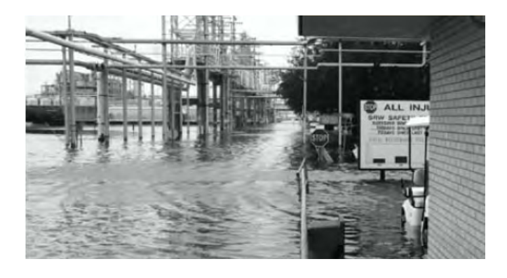
2008 - Hurricane Ike left INVISTA's Orange facility standing in five feet of water and severely damaged many employee homes. The plant was shut down for months.

Unfortunately, troubles in Orange were nothing new. In 2004, the plant's previous owner gave up on efforts to develop next-generation ADN technology. A string of powerful hurricanes followed, forcing costly shutdowns. Then came an incident that injured two workers and caused a toxic release. The plant had such a bad reputation locally that it became tough to recruit new employees.