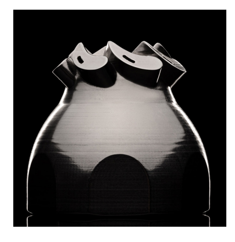
A marine burner atomizer (close-up, left, after installation, below) made using 3D printing techniques. It cannot be manufactured using traditional machining methods.